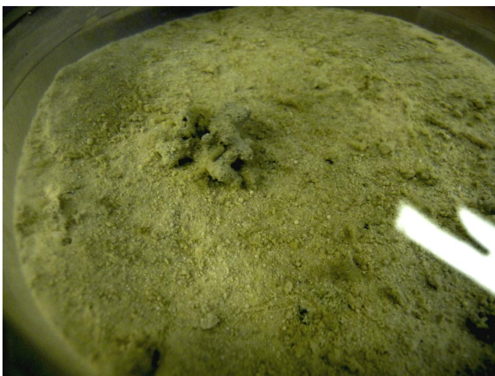
Appendix 5.B.3. Top view of sediment core JC062-126 (H4) that in the present study. Sporadic phytodetritus patches is visible on the surface.