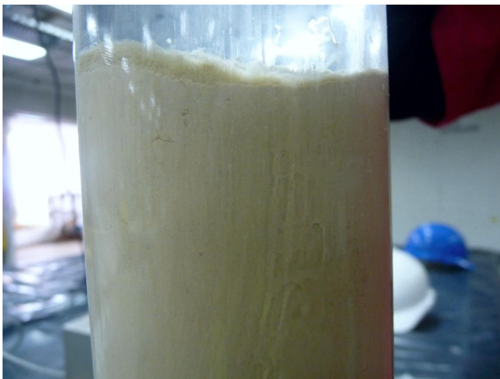
Appendix 5.B.2. Sideview of sediment core JC062-101 (P3) used in the present study. A phytodetritus layer is visible on the surface.